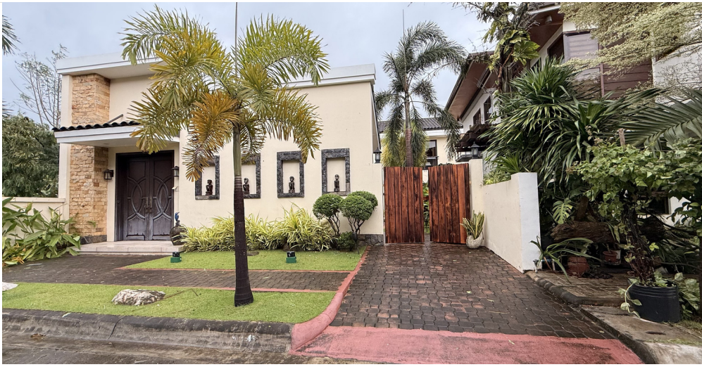
The back entrance of my garden, on the right the massive wooden broken open gate.