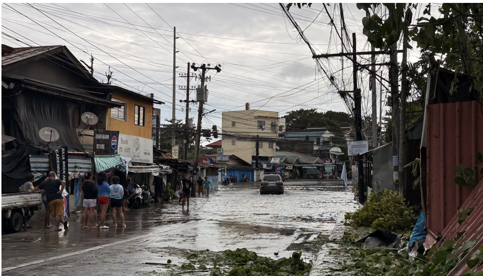
And this is at present the exit of the village area we live. On the road, the water is still 30 cm deep in the center.

For photos of the dramatic situation in Cebu and environments, you can google hundreds on the internet. I rather emphasize a happy moment where the mother and sister leave for Italy with a group of Cebuano friends. They will visit Italy from Venice down to Rome, the entire trip very focused on religious sightseeing and organized by a group of close friends, which are all doctors from our main hospitals here.